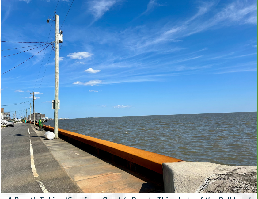
A Breath Taking View from Gandy's Beach. This photo of the Bulkhead Repair Project was taken as the Project was nearing completion.