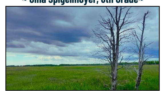
The peaceful beauty of the Downe Marshlands. A haven for birdwatchers and photographers alike.